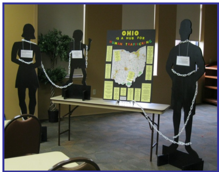
Chained images speak loudly at a recent display organized in Tiffin.